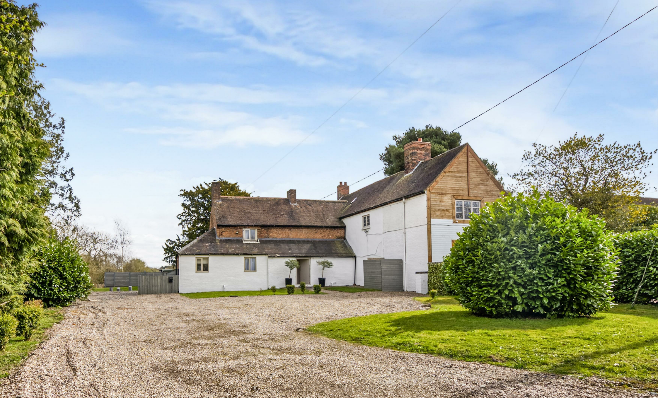
Blythbury Farmhouse Cottage, Shifnal, Shropshire, TF11 9PQ